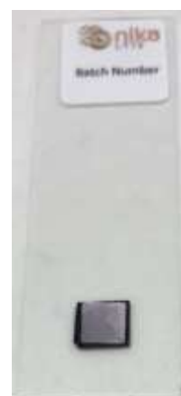
Figure 2 SERS substrate ready for testing after application of analyte